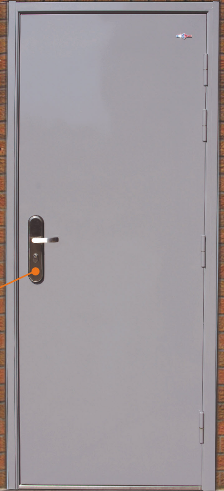
Standard & Heavy Duty Door