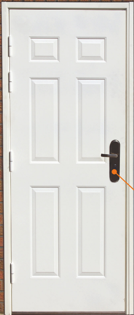
Georgian Panel Door